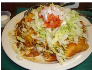
A Picture of a “Navajo” Taco!!!

Just as the prisoners who attempted to escape from Alcatraz were swimming for their lives, these youth, too, are swimming for lives—theirs and their families and friends—swimming on a mission for their tribe, reminding themselves why they are doing this: “ Oyate kin nipi kte: So that the people will live... ” Thank you to NHI and The Trillion Space!